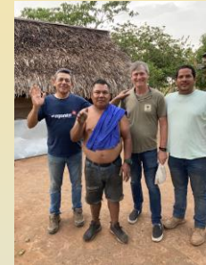
Outreach and missionary training in Colombia