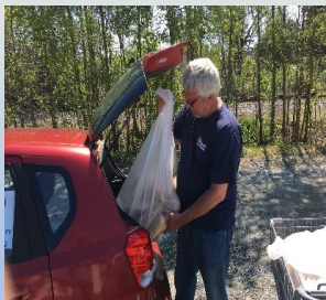
Smithfield Rescue Mission CarePoint