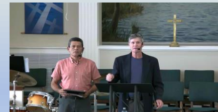
Preaching and Teaching videos with translation

Evangelism/Discipleship/Pastor Training – Pastor Care/Training & Support, Youth and Family Outreach, Spiritual Care for pastors