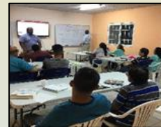
Pastor Support & Training in Panama