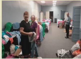
1 st Presbyterian Church CarePoint Raleigh NC