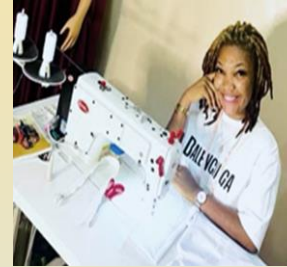
Job Training and Tailoring Business "Fingerprint Creations" in Nigeria