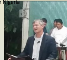
Preaching/Teaching in Nicaragua

Give Hope by giving a gift on-line or make checks payable to: