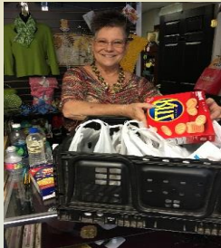
Dream Coat CarePoint Knightdale, NC

Connecting people who care to people who need the care and hope through caring relationships and food distribution