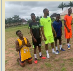
Youth Soccer outreach & Water of Life CareProjects

Nigeria - Community Needs Assessment, Pastor/Leadership Training, Support of Local Economy through USAfrican Outreach Foundation; Employment, Food, Youth Sports Outreach Ministry