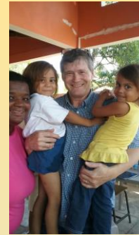
Honduran Child Rescue